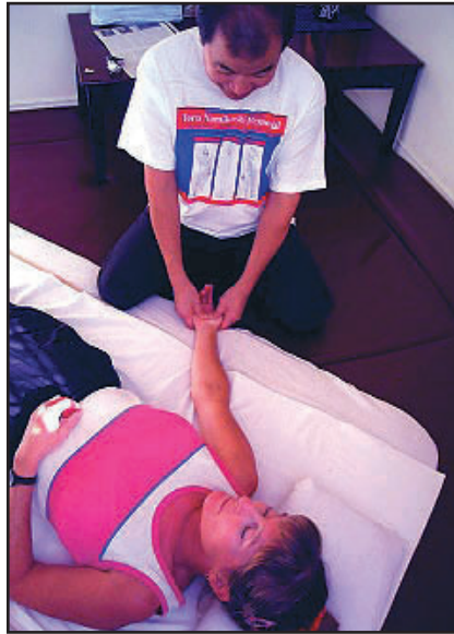
Saito applies thumb on thumb application on the client's palm of hand where there are three major shiatsu points.