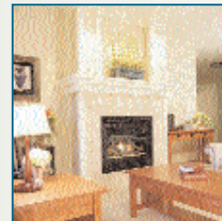
2 Bedroom Suite