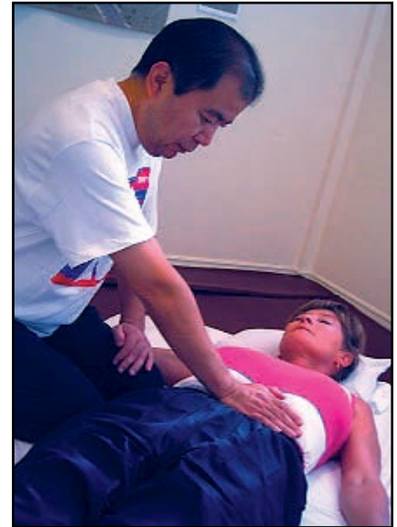
Saito applies gentle palm pressure on the client's abdomen in a clockwise circular motion preceding pressure point application.

causing tension in this area. Over a long period of time, sitting in one position using the arms only on a daily basis precipitates an energetic imbalance in the body where some muscles move but not others. Consequently, this causes an imbalance in the whole body.